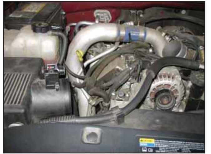
d. Remove the inlet tube and resonator from the engine bay.