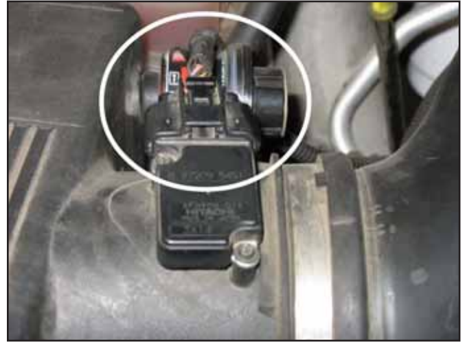
b. Unplug the mass air flow (MAF) sensor wiring harness.