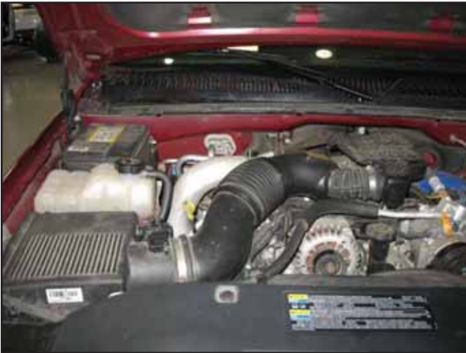
Factory air box system installed

n. Plug the MAF sensor into the wiring harness. Be sure that the harness is not in contact with any hot part of the engine.