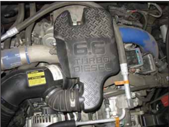
c. Lift up on the intake resonator to pop it off the mount. Loosen the hose clamps on both ends of the inlet tube.