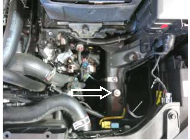
b. Install the 6mm rubber mount in the stock air box mounting hole.