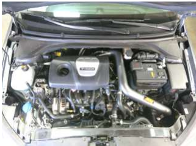
j. Install the engine cover by aligning the post to the rubber grommets, then pressing down until they are seated.