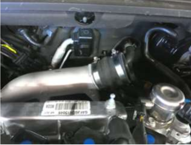
a. Install the supplied coupler and the 2 #44 band clamps. Tighten the turbo tube side only.

a. When installing the intake system, do not completely tighten the hose clamps or mounting hardware until instructed to do so.