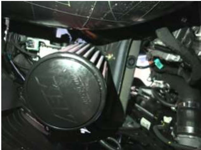
f. After pulling back the fender liner, install the AEM Dryflow filter with provided band clamp into the AEM intake tube , then tighten the band clamp with a 8mm nut driver.