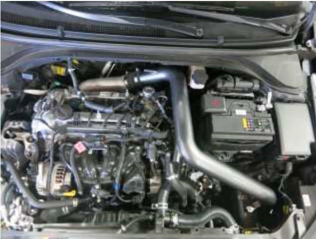
c. Install the AEM intake tube into the coupler, then attach the tube to the 6mm rubber mount with supplied M6 nut and washer. DO NOT TIGHTEN THE BAND CLAMP UNTIL FILTER IS INSTALLED.