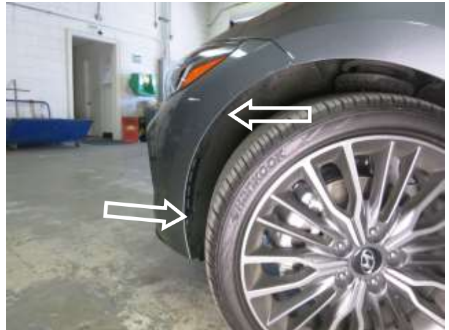
d. Turn the steering wheel to the left and remove the 2 fender liner clips by using #2 phillip screwdriver.