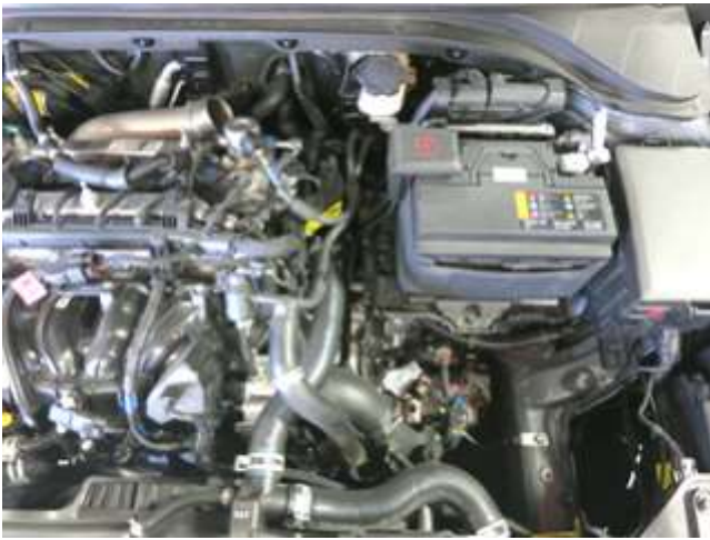
g. Lift and remove the lower air box housing and scoop. AEM recommends that you do not discard the factory intake system.