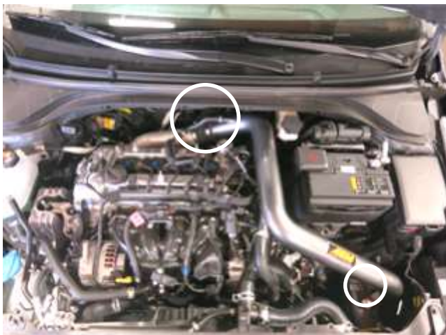
i. Properly align the intake tube to make sure there is clearance, then tighten the band clamp with a 8mm nut driver and also tighten the M6 nut on the rubber mount.