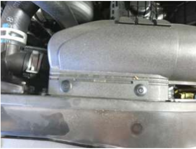
e. Remove the 2 clips holding the air scoop with screwdriver by depressing the center pin.