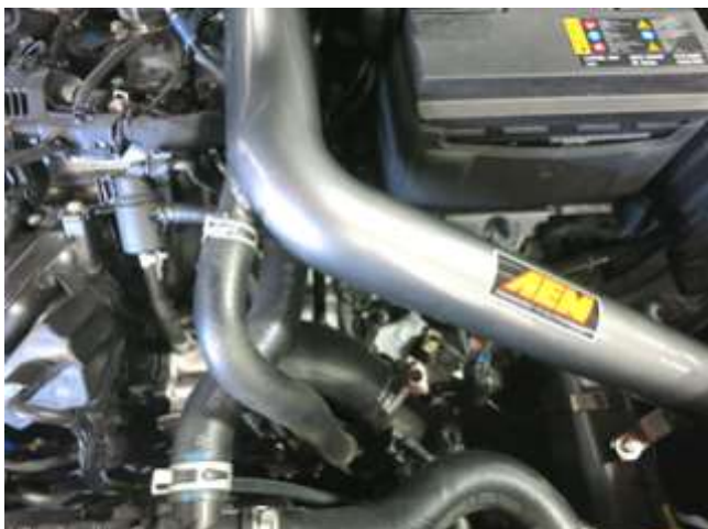
h. Reinstall the recirculation hose to the intake tube and secure using the stock spring clamp.