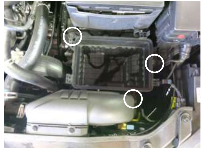
f. Remove the 3 bolts that secure the lower air box housing with a 10mm socket and ratchet.