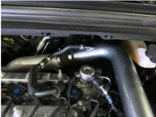
g. Reinstall the PCV hose to the AEM intake tube and secure using the stock spring clamp.