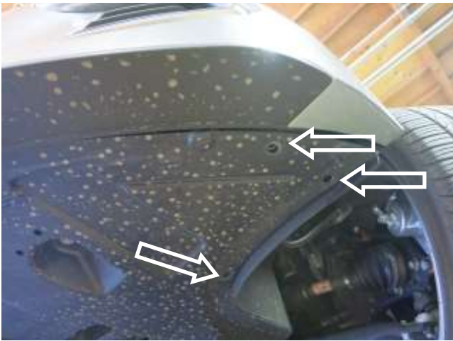
e. Underneath the car on driver side, remove the 3 fender liner clips by using a #2 phillip screwdriver.