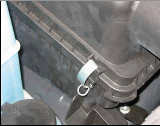
e. Unclip the four clips securing the airbox lid to the lower airbox. This is the first clip.