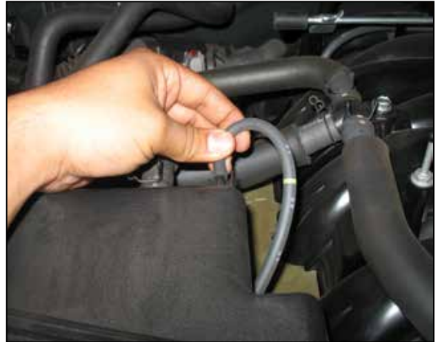
b. Remove the small hose located on the back of the inlet resonator.