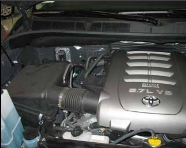
a. Factory airbox system installed.