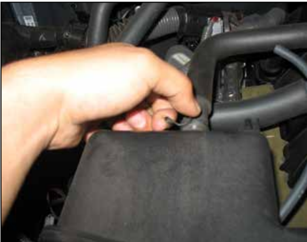
c. Pinch the hose clamp, and remove the larger hose from the inlet resonator.