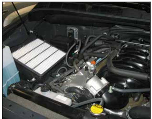
j. Remove the stock inlet tube and airbox lid assembly.