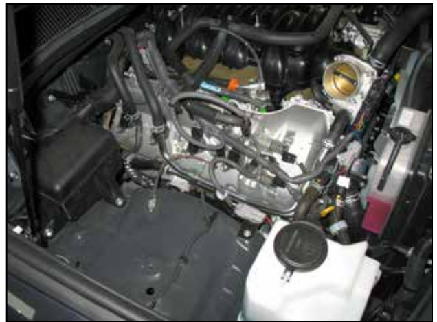
n. Stock airbox system removed from the engine bay.