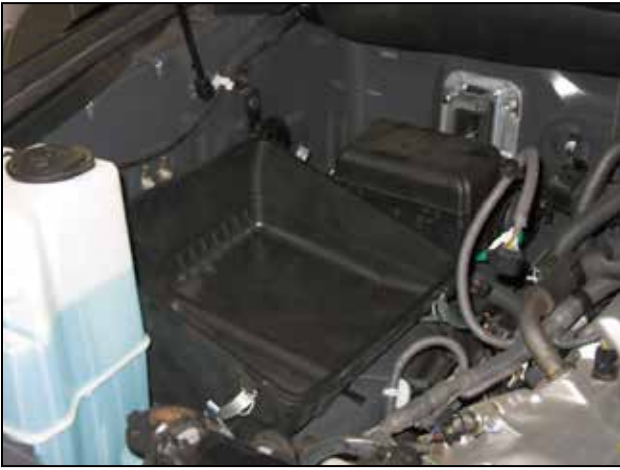
k. Remove the stock air filter from the lower airbox. box.