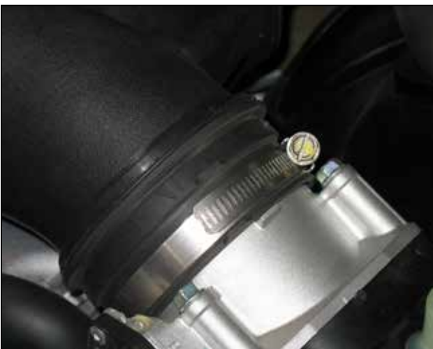
i. Loosen the hose clamp securing the stock inlet tube to the throttle body.