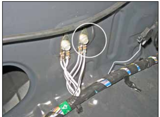
p. Within the engine bay, locate the ground bolt located on the passenger side inner fender. Remove the ground bolt closest to the firewall.