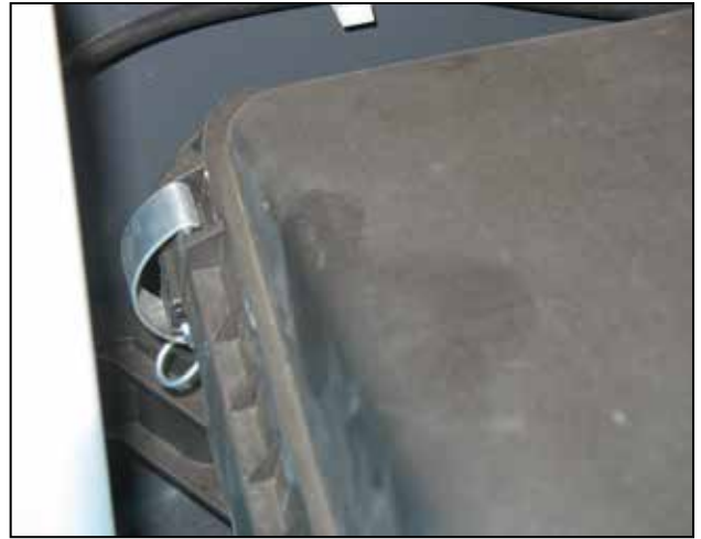
f. Unclip the second airbox clip.