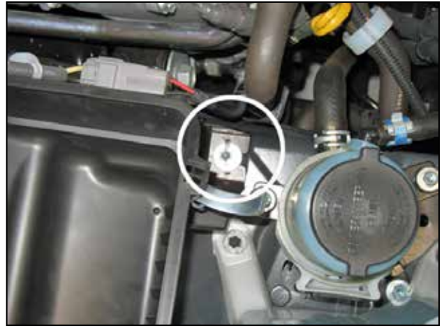
l. Unscrew the two bolts that secure the lower airbox. The location of the first bolt is pictured above.