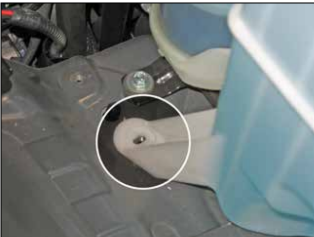
o. Remove the bolt securing the windshield washer fluid container.