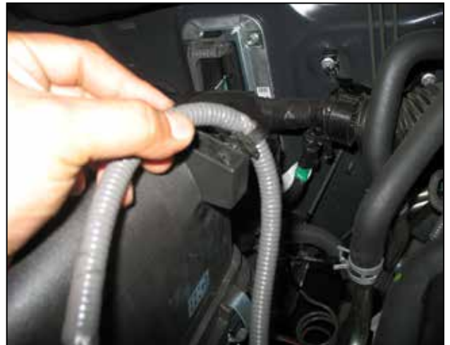
d. Release the zip tie from the airbox lid. Unplug the wire harness plug from the mass air flow sensor.