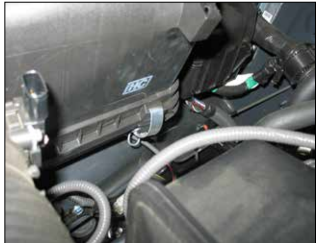
h. Unclip the forth airbox clip.