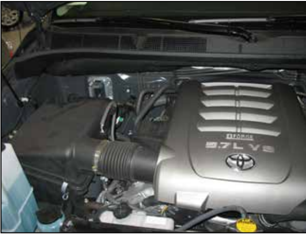
Factory airbox system installed