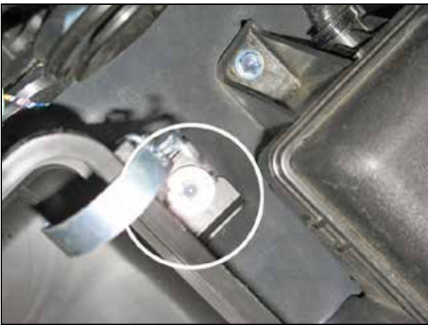
m. Remove the second bolt securing the lower airbox.