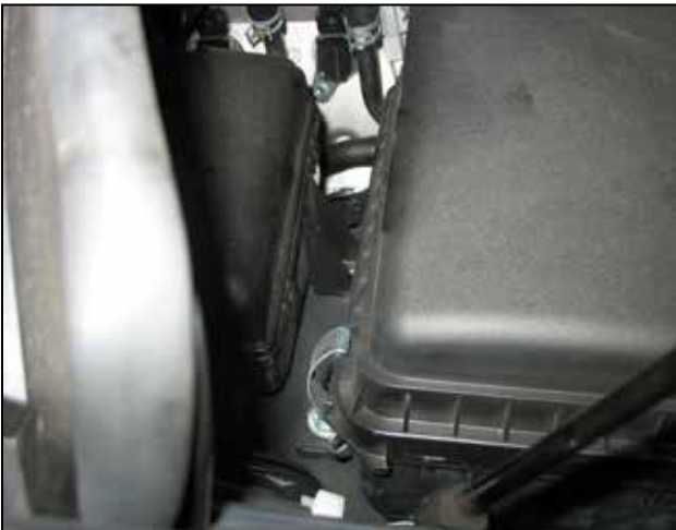
g . Unclip the third airbox clip.