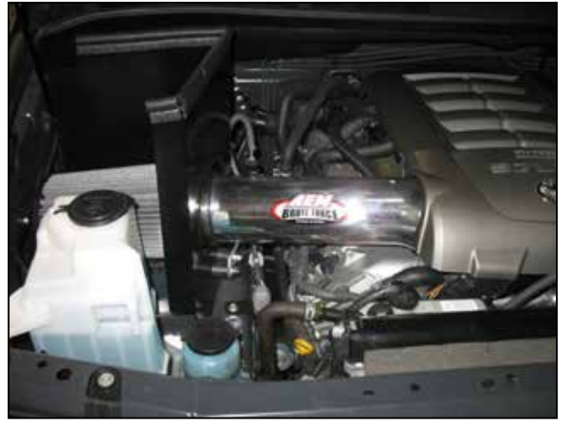
AEM® intake system installed